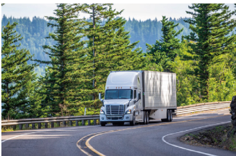
Asset & Logistics