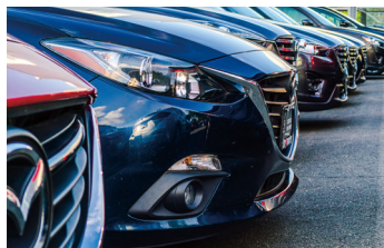
Used Car Business